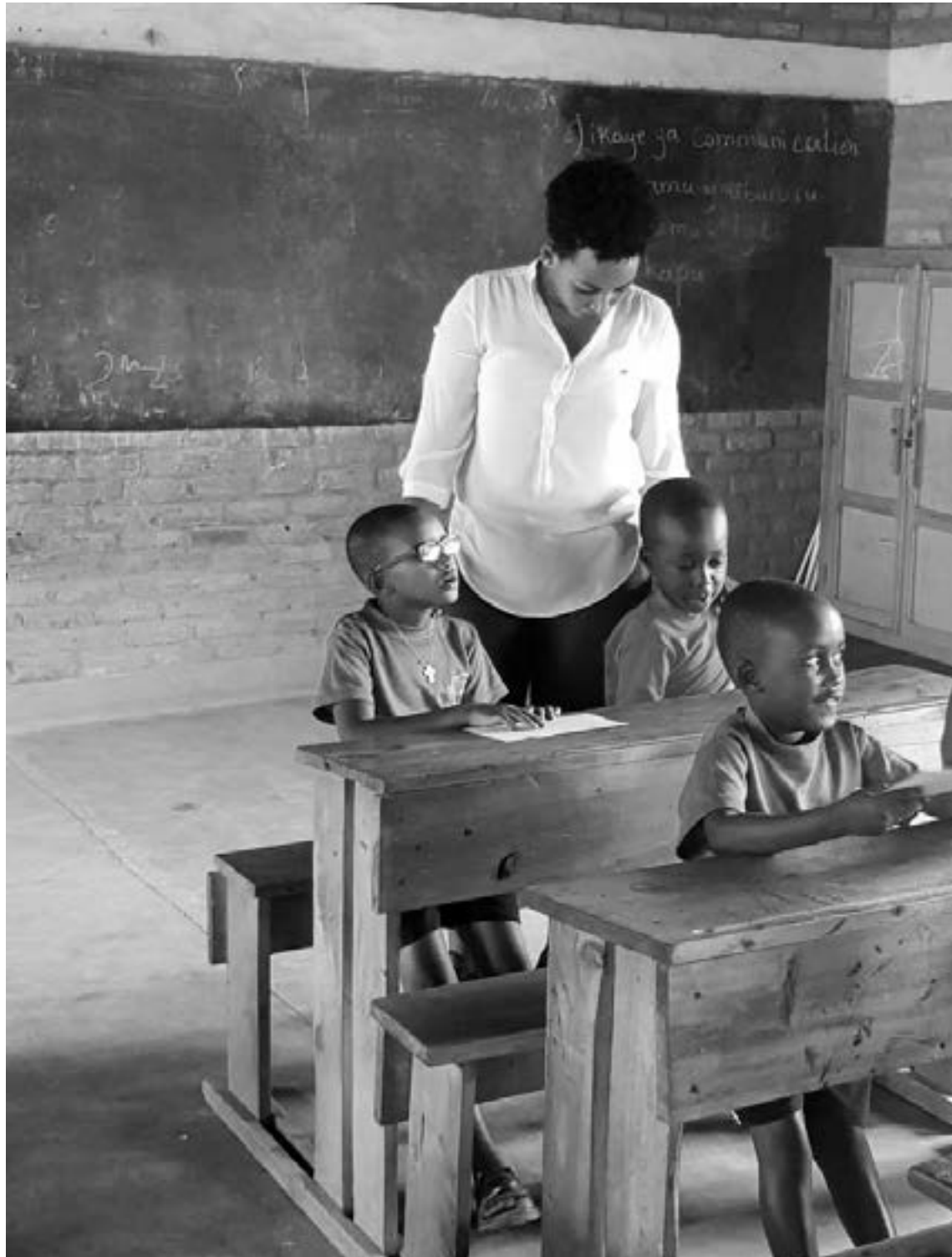
Umuyobozi wa Jordan Foundation.

“Uyu mwaka twateganyaga kurangiza amashuri abanza y'abana batabona turera, ariko ntibyakunze kuko iki cyorezo cyahungabanyije ubukungu bw'abafatanyabikorwa bacu