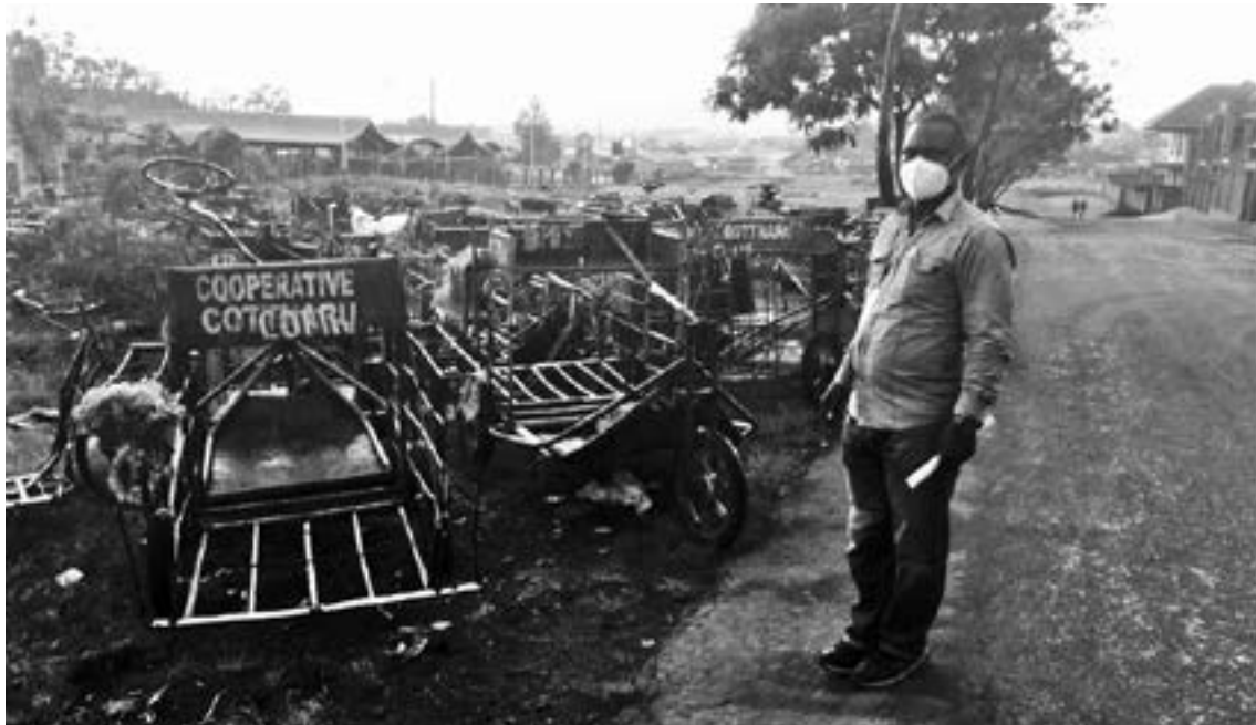
Abafite ubumuga baucuruza kumupaka w'u Rwanda na Kongo.