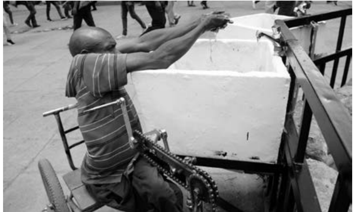
Bimwe mu bikorwa bya serivise bibangamira abafite ubumuga.

A bafite ubumuga b'ingeri zose bishimira ko mu Rwanda hashyizweho amategeko aborohera, nyamara bakanenga uburyo ashirwa mu bikorwa kandi abanyuranya nayo ntibafatirwe ibihano. Bavuga nk'itegeko no 01/2007 ryo ku wa 20/01/2007 rivuga ku burenganzira bw'abafite ubumuga.