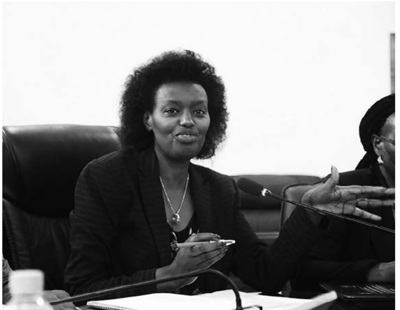
Minisitiri w'ubutegetsi bw'igihugu, Prof. Shyaka Anastase.

Usibye izi ngaruka zigera ku miryango y'abafite